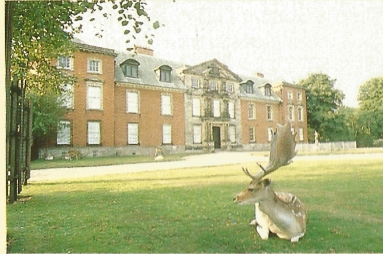
Dunham Massey Hall