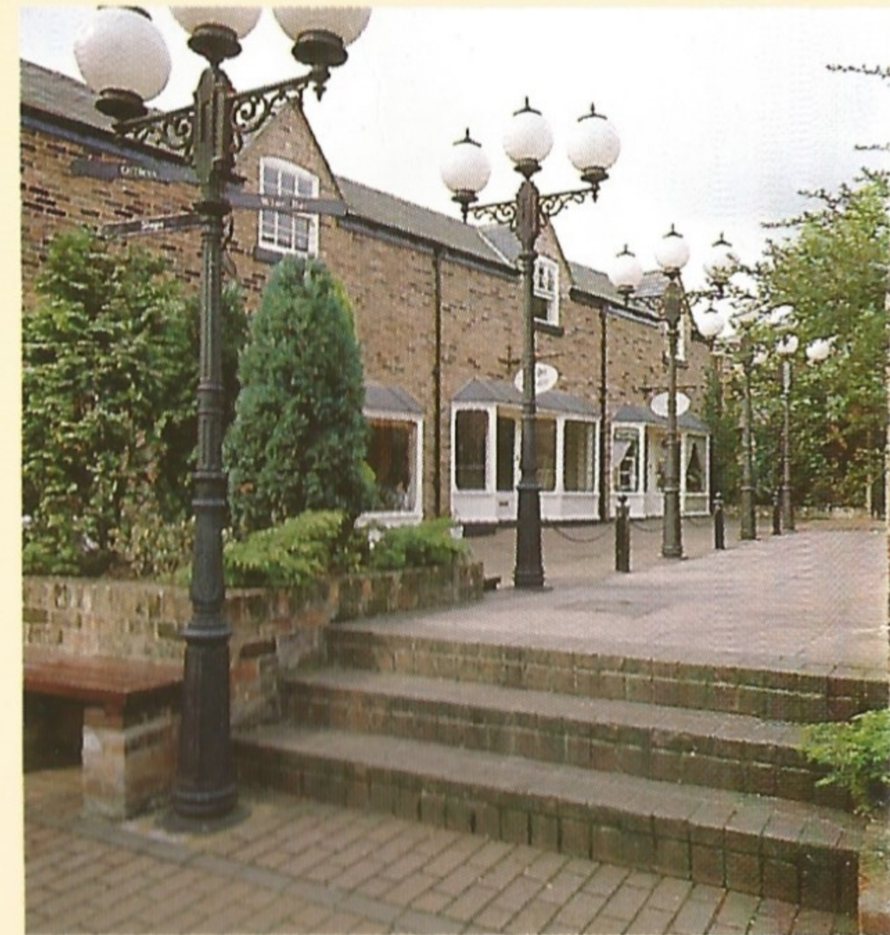
Kings Court, Altrincham

We hope you have found this publication useful and look forward to meeting you or speaking with you in the future.