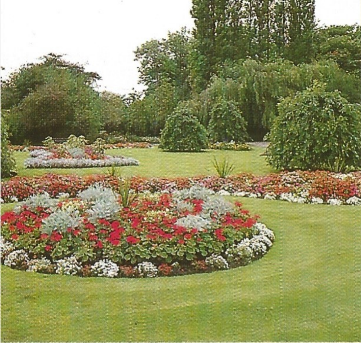
Parks in Trafford