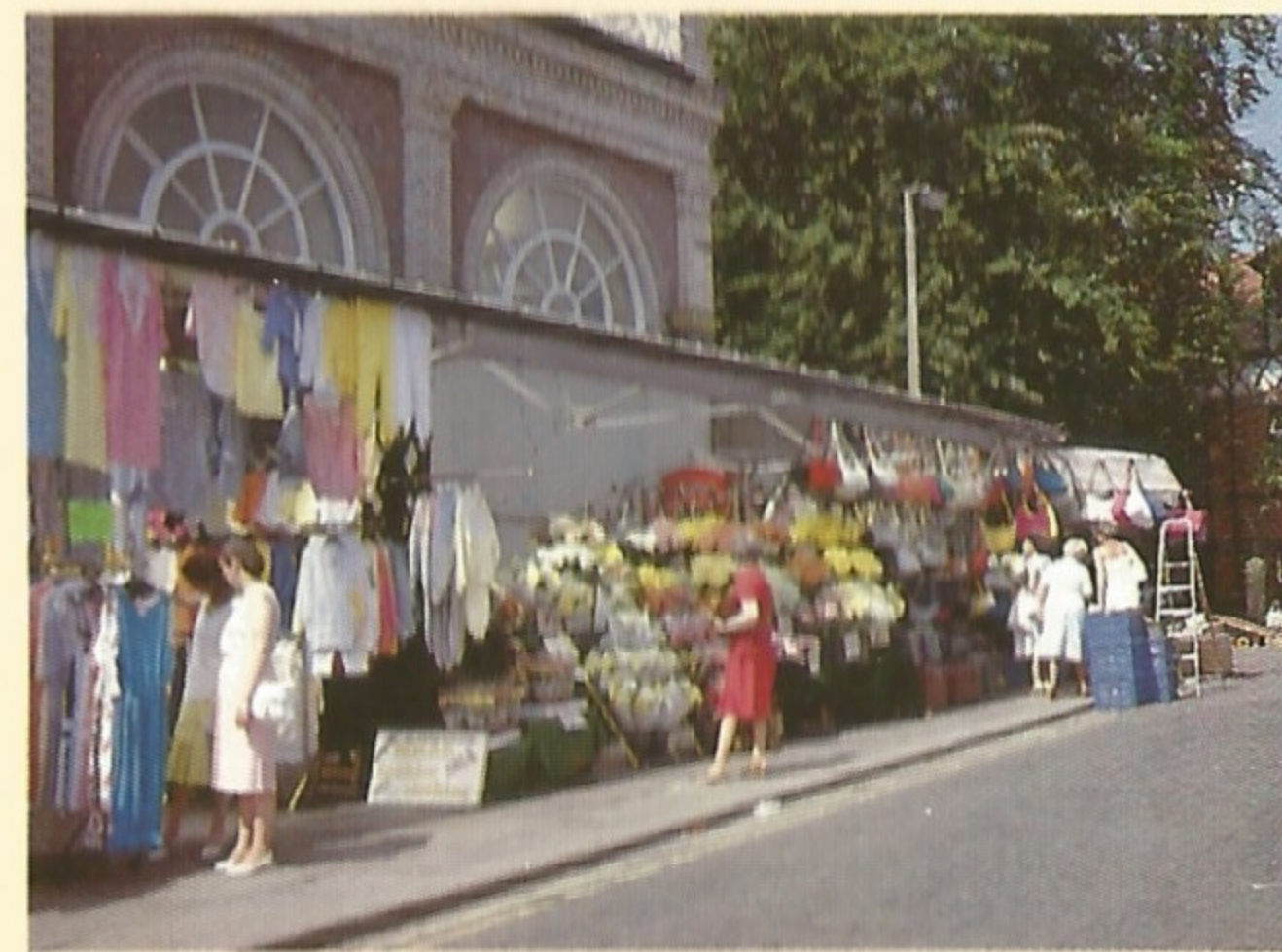
Market Day in Altrincham

Whilst every care has been taken to ensure that the information in this publication is accurate, Trafford Borough Council cannot accept responsibility in respect of any error or omission which may have occurred.