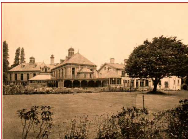
St Anne's Home as it was in 1938, with its mix of Victorian domestic and purpose-built hospital buildings. It could be restored to look like this once again.

Another long running saga that may soon reach a conclusion!