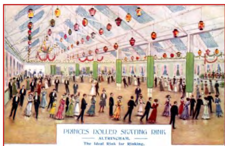
The top floor of Oakfield House on Oakfield Rd housed a roller skating rink in 1911, as seen in a digitised postcard from the Altrincham Area Image Archive.

Last year, the Society applied to the Heritage Lottery Fund for a grant of £50,000 to encompass projects which include a Heritage Trail for the town; an historic plans interactive web site; an oral history project; a treasure hunt in conjunction with Rotary and the digitisation of many local photographs and postcards held by both groups and individuals. This was approved in March and work has begun, with completion expected by the spring of 2012. For further details on the projects see altrinchamheritage.com