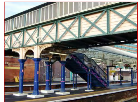
Altrincham Station's original 1881 pedestrian bridge is due to be demolished under proposals.

Committee members have sat with the Friends of the Interchange and the Core Steering Group as part of the pre-consultation process of the £19 million redevelopment of the Altrincham bus, train and metro interchange. Although the Society welcomes the redevelopment, we have expressed our concern at the demolition of the original 1881 pedestrian bridge and its replacement with a new diagonally placed bridge. We consider the case for demolition does not stand up to scrutiny and that options to retain it have not been properly explored. A new bridge is only required to join platforms 3 and 4 and so the current bridge could still be retained, with both bridges linking to the proposed Altair development. The full public consultation will close on 25 October 2010.